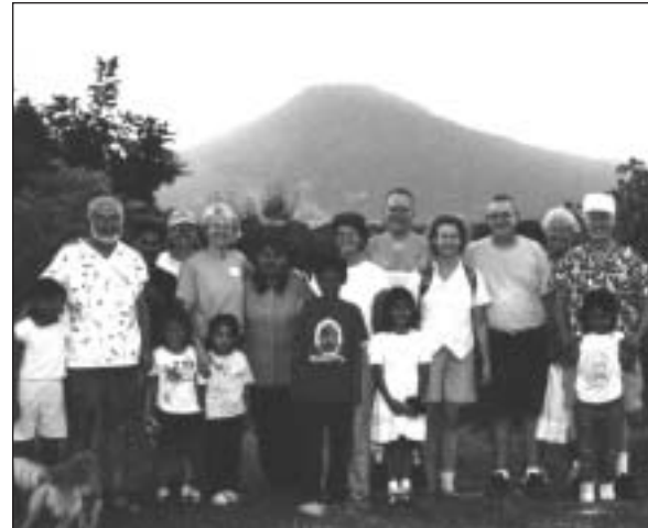
The dental crew poses with friends from the Cabañitas community in 2000.