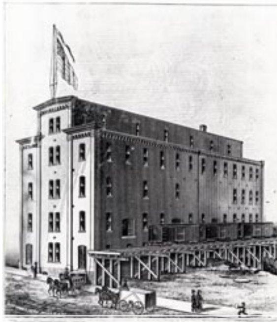
THE "STANDARD" MILL, MINNEAPOLIS, MINN

OCTOBER 9-12, 2002 HOLIDAY INN METRODOME MINNEAPOLIS, MINNESOTA