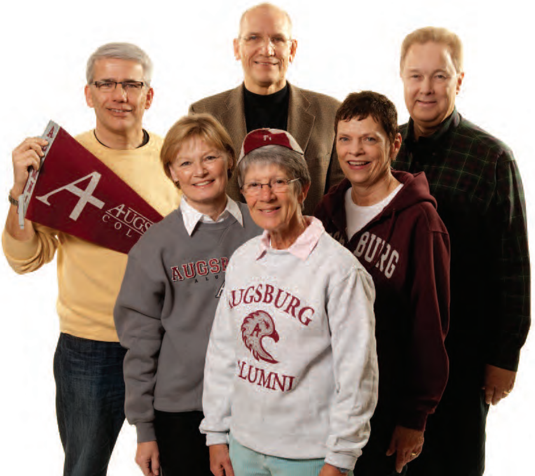
Class of 1971 reunion committee

Enjoy a 60-minute student-led walking tour highlighting campus architecture, history, updates, and additions. Tours will begin at the Welcome Desk in the Christensen Center.